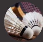
SWEAT OUT DOORS