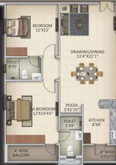
A8 | 2BHK - North | 1211sft.