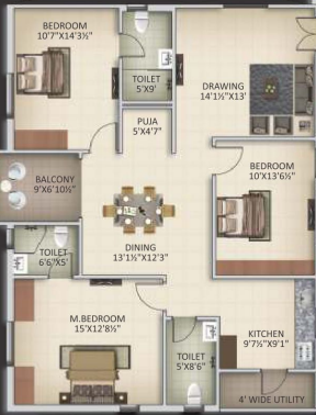
A10 | 3BHK - East | 1650sft.