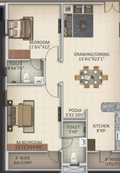
A5 | 2BHK - North | 1211sft.