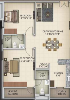
A6 | 2BHK - North | 1211sft.