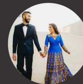
LIVE IN PARTIES