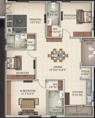
A2 | 3BHK - West | 1650sft.