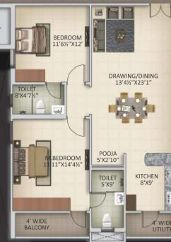
A4 | 2BHK - North | 1211sft.